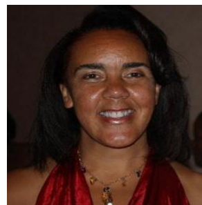
By Deborah Evans

I hope this message finds you in good health and spirits. As difficult and challenging as the past 24 months have been, the consistent support we have seen from our members has been inspiring. As we emerge from the craziness of an almost lost season due to the pandemic, we are aware our members are eager to plan visits & enjoy outdoor activities. Fortunately the winter resorts were able to remain open & some did venture to their favorites despite some remaining challenges.